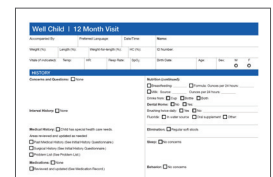
Example: 12-Month Visit Documentation Form