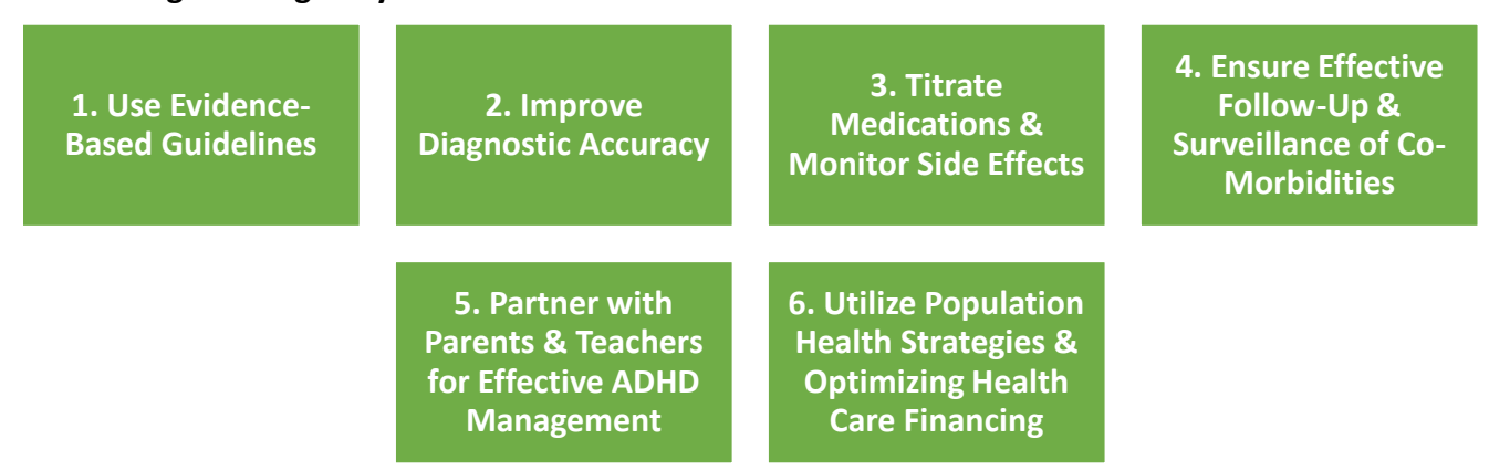
Figure 1. ADHD Change Package Key Drivers

Tables 1-6 include the full list of key drivers and interventions that practices have successfully implemented to improve ADHD care for their patient population. A high-level overview is below.