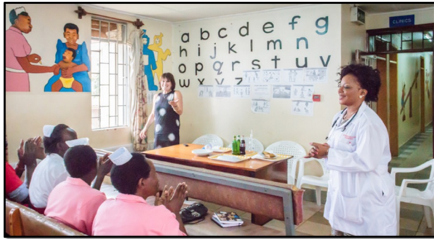
Quality Improvement Project, Adolescent Clinic Uganda ICATCH 2014-2016

→ More than just continued Funding or Dedicated Time