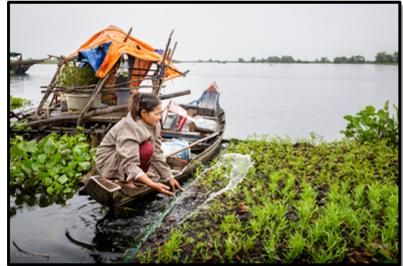
Floating Gardens for Health and Prosperity, ICATCH 2016-2019 (Improving Child Nutrition)