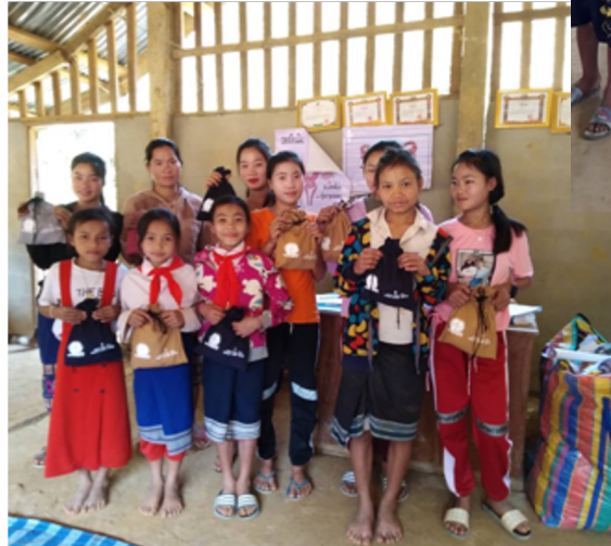
Engaging Ethnic Communities in Rural Adolescent Health Knowledge in Laos, ICATCH 2018-2021