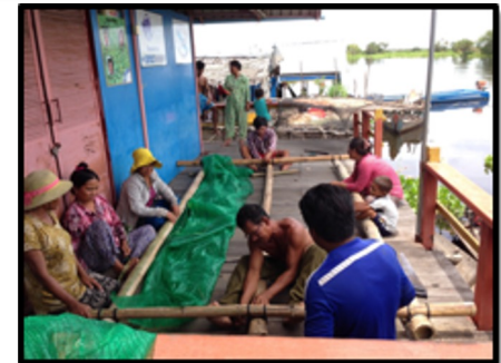
Constructing floating gardens on Tonle Sap Lake