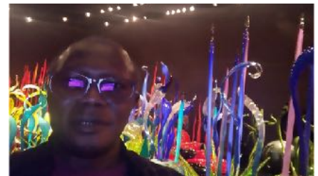
Seattle: (Top Row - L - Grand Rounds; M - UW PROGRESS; R - Dinner with General Surgery Staff; Bottom Row - Touring Seattle - L - Space Needle; M - Waterfront; R - Chihuly Garden & Glass)