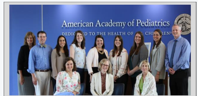
AAP PLACES Project Advisory Committee and researchers at 2019 PLACES annual meeting