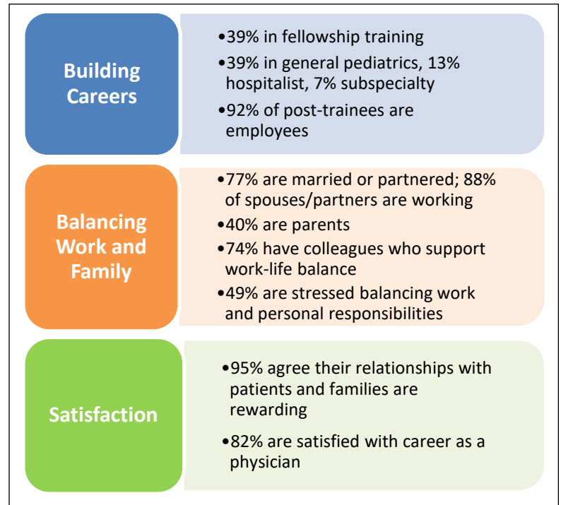
Figure 2. Careers, work-life balance, and satisfaction of PLACES participants in your cohort